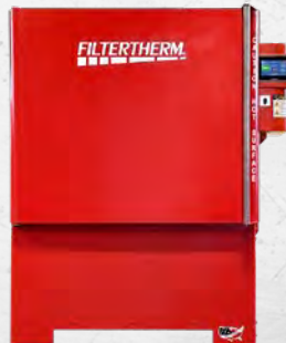
LARGE CAPACITY DPF CLEANING OVEN