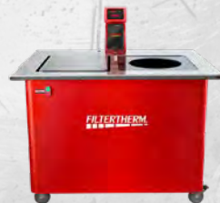
VERSATILE INSPECTION TABLE

THE TIME PROVEN PROCESS FOR BAKING AND BLOWING OUT MULTIPLE FILTERS PER DAY.