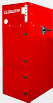
ADVANCED PULSE MACHINE