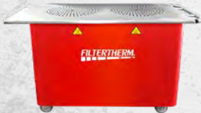
TIME-SAVING COOLING CART