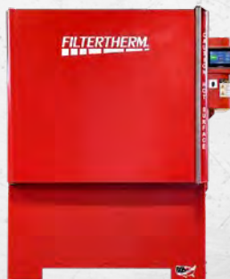
LARGE CAPACITY DPF CLEANING OVEN