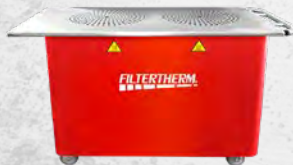
TIME-SAVING COOLING CART