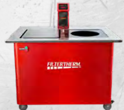
VERSATILE INSPECTION TABLE

THE TIME PROVEN PROCESS FOR BAKING AND BLOWING OUT MULTIPLE FILTERS PER DAY.